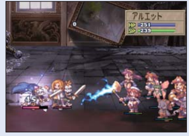
Attack simultaneously or in relentless waves.

Print: Gameplay trailer in the hands of 500,000 hard-core gamers via Official Playstation Magazine's March demo disc.