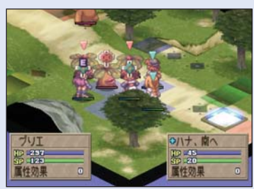
Turn vicious enemies into faithful allies.